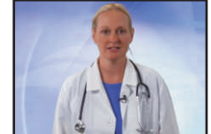
Surgeon at Teaching Hospital