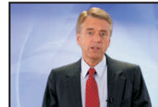
High Reliability Expert